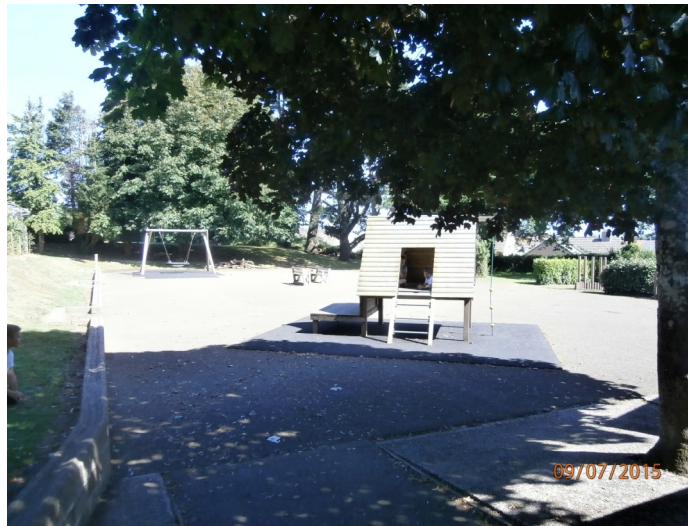
I will play on the same playgrounds as before.