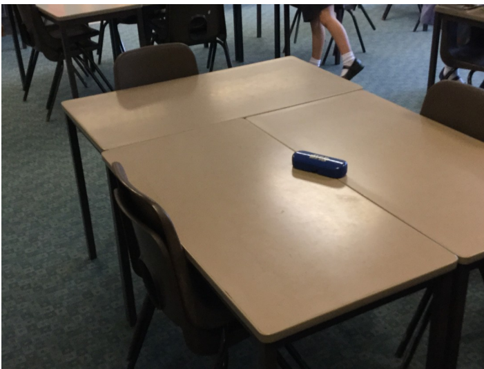
I will sit at a table