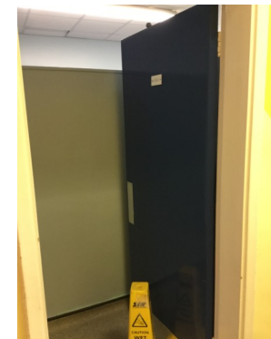
The boys use this side.