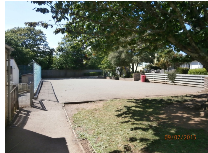
We can play with our friends and run around.