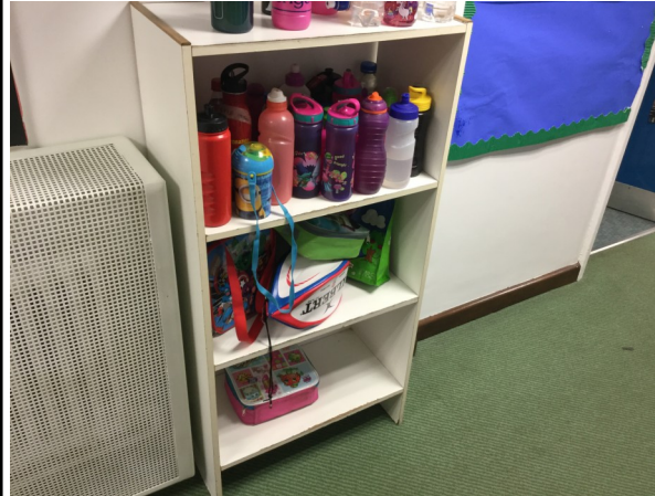
This is where I put my drink bottle and packed lunch.