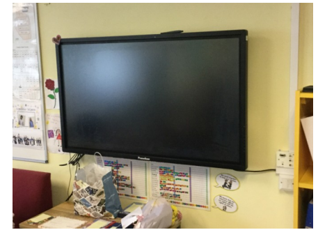
This is where I learn and sit down to listen.