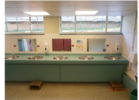
This is the toilet area.