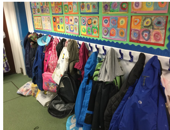
This is where I hang my coat and bag.