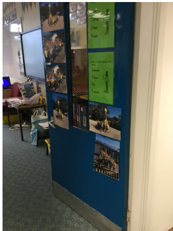
This is the door to my classroom.