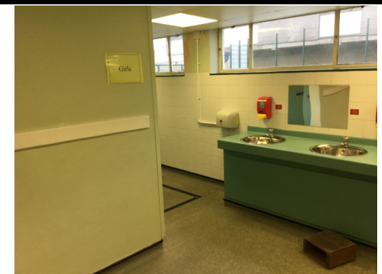
The girls use this side.