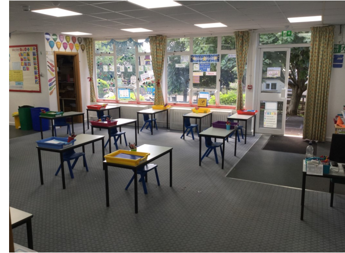
This is my classroom.