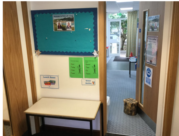
This is where I put my drink bottle and packed lunch.