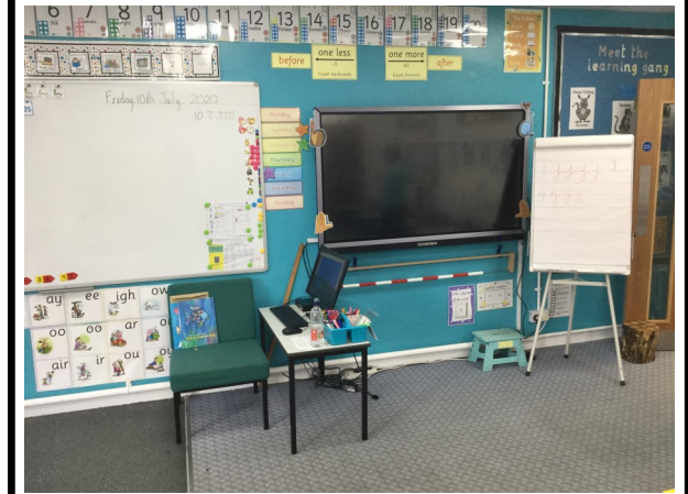
This is where I learn and sit down to listen.