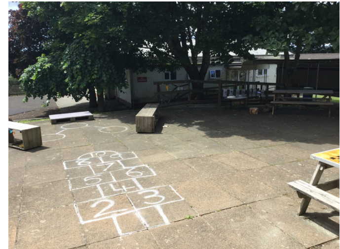
This is our outdoor area and patio.