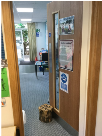
This is the door to my classroom.