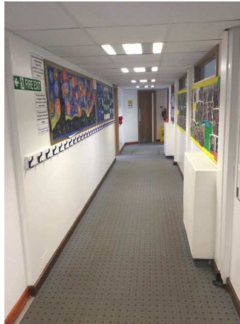
This is where I hang my coat and bag.