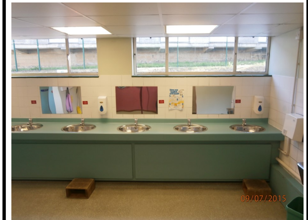
This is the toilet area.