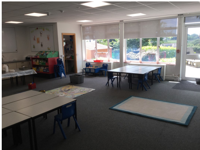
This is the other classroom we'll be in.